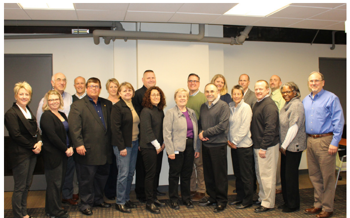
MOC Task Force