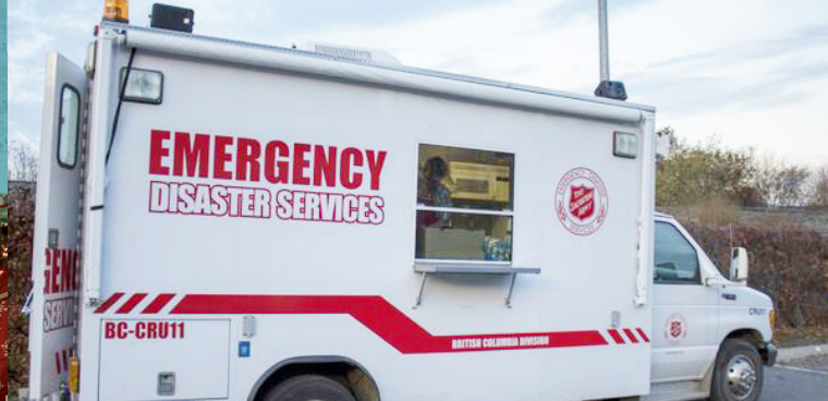
BOC staff volunteering at Kids Cruisin' Kitchen food truck.