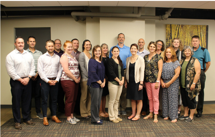
Exam Development Committee

The continuous commitment to the development and administration of a quality certification program has produced a highly regarded program recognized as the gold standard for identifying entry level athletic training professionals. We thank everyone for their service to support the growth and success of the BOC.